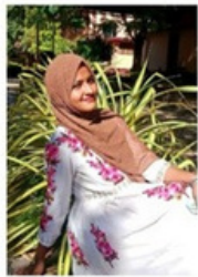
Jenisha A-ZONE 2 - Malayalam Speech