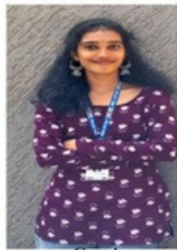
Gouri A-ZONE 3 - Patriotic song