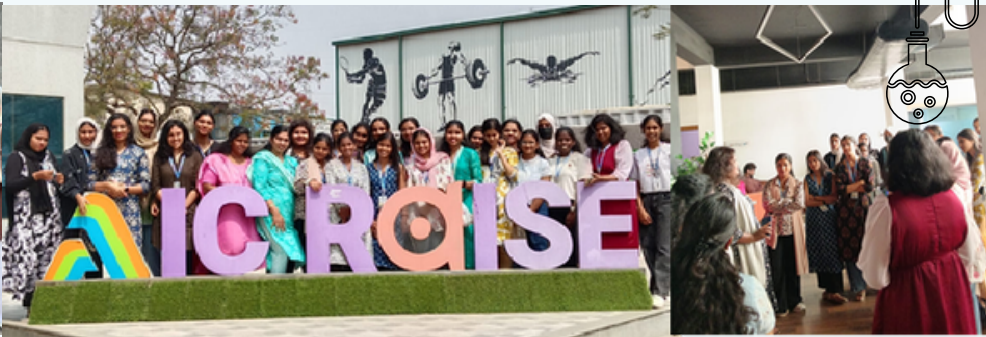
INCUBATION CENTER VISIT IN ASSOCIATION WITH IIC (Institution's Innovation Council)