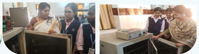
BRIDGE COURSE-FUTURE OPTIONS OF BIOTECHNOLOGY